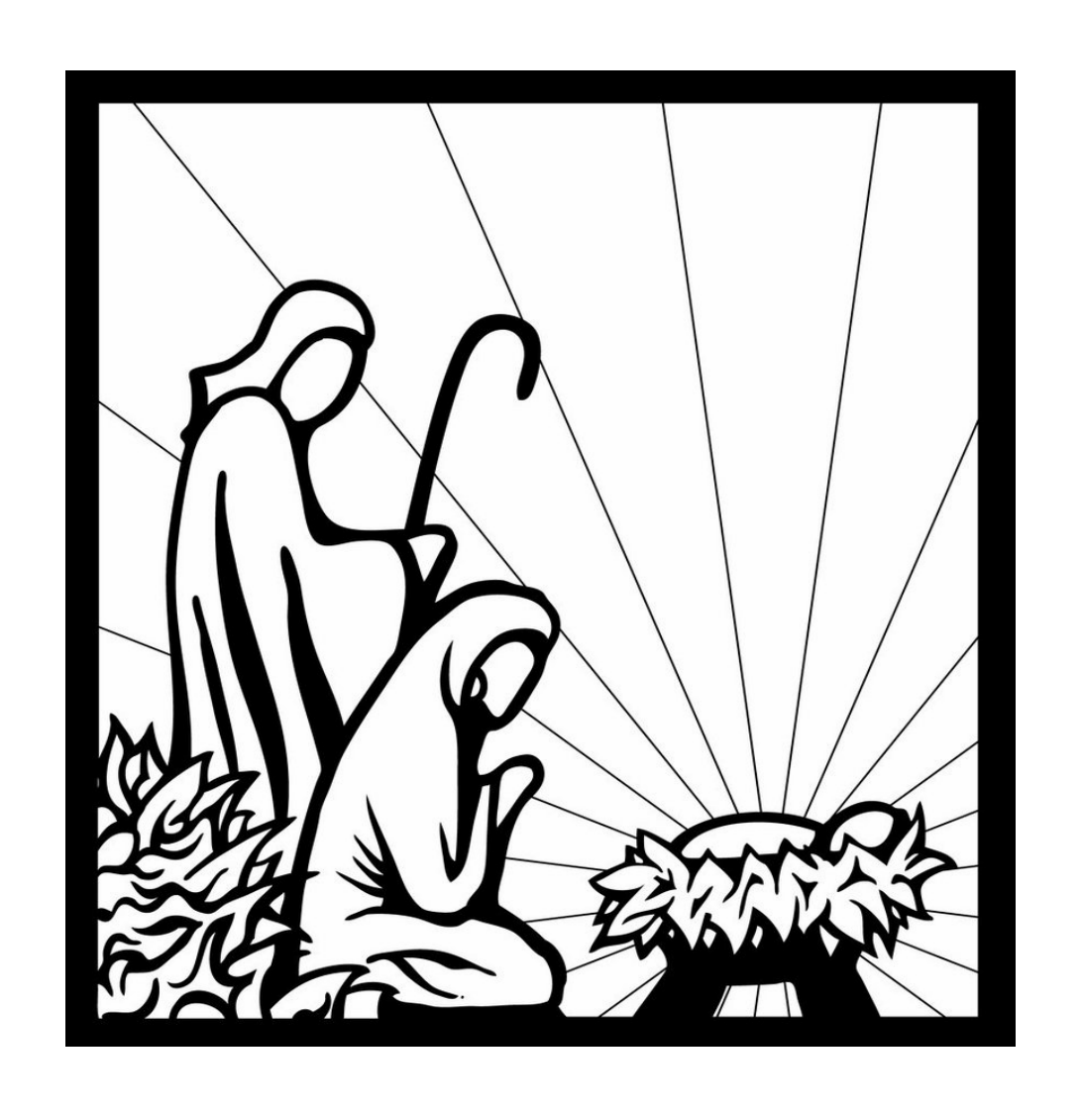
Sunday School Christmas Service Sunday, December 22, 2024 "We See His Light"